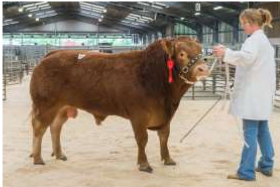
Top price bull – Barrons Matador