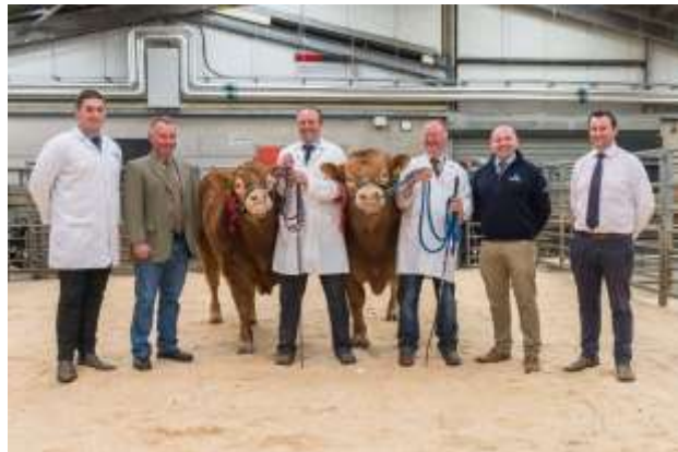
Judge with champion and reserve