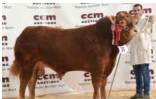
Tomschoice Matador - Champion