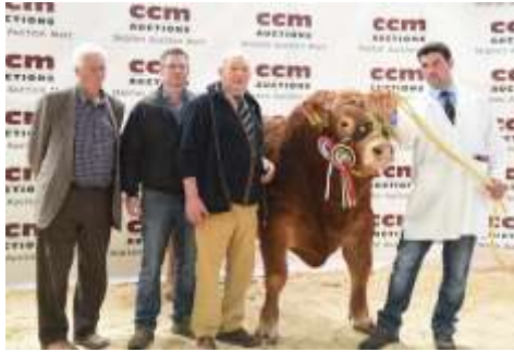
Gunnerfleet Lanky - champion