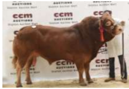
Garrowby Hurricane – top price