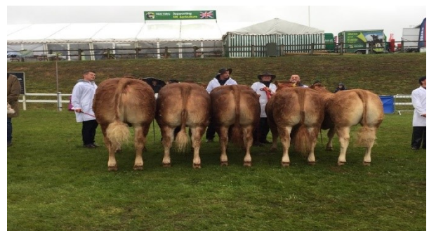
Reserve Champions – Group of 5 – first time at Royal Cornwall for this Class!