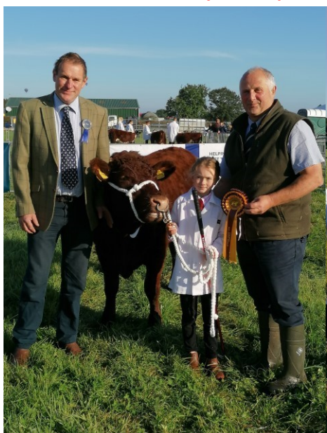
11 yrs & under won by