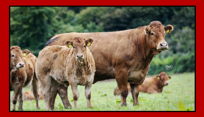
Lot 17 & 18 Killerton Iceage & her Heifer Calf Killerton Syd