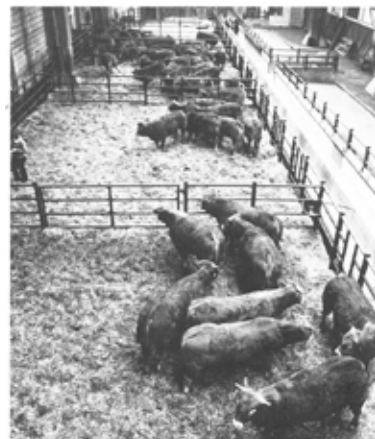
First Limousin imports to U.K. Quarantine