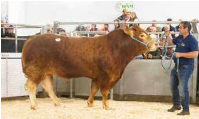
Rachels herd - top price bull Rachels Umbro sold for 13,000gns