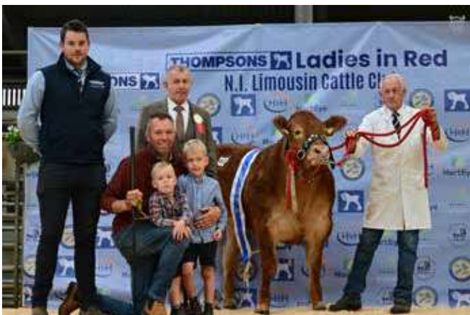
18,000gns Intermediate and reserve supreme champion Ampertaine Villie.