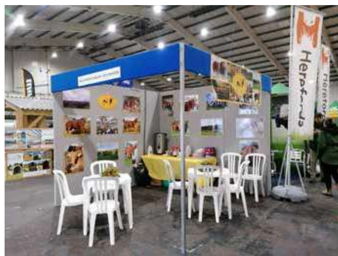
Agrifest 2025 Lim Stand