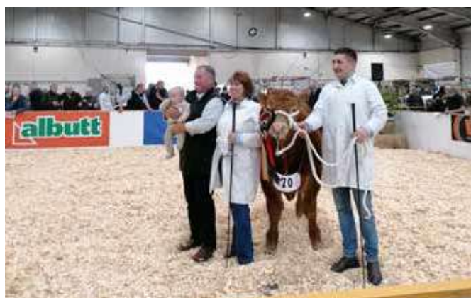
Agrifest 2025 - Alfords - Champion Pedigree Bull Calf - Foxhillfarm Alberto