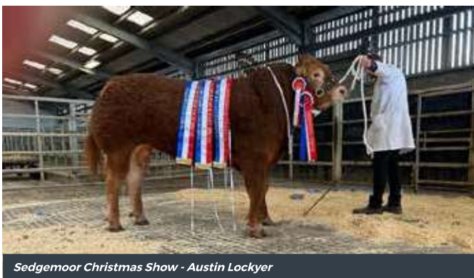
Sedgemoor Christmas Show - Austin Lockyer